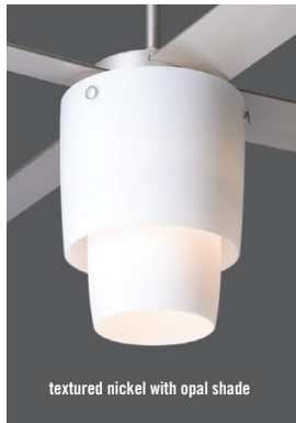
textured nickel with opal shade

halo special notes 1. Best suited for 9-foot ceiling or higher.