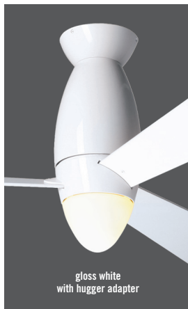
gloss white with hugger adapter

dc slim special notes 1. This fan uses a 18w GU24 fluorescent lamp and is therefore not dimmable.