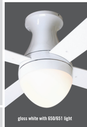
gloss white with 650/651 light