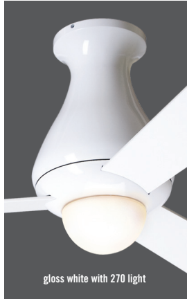
gloss white with 270 light